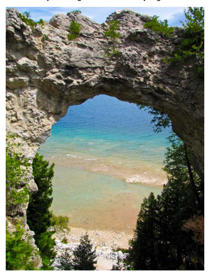
A view of Arch Rock on Mackinac Island.

touring the island enjoyed a great fireworks display over the bay in St. Ignace on Saturday night.