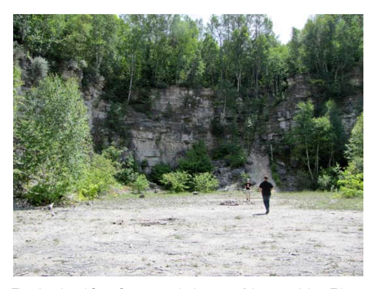
The abandoned Scott Quarry was the last stop of the second day. Trip participants collected fossils from the Cordell Limestone found in the quarry which included corals, brachiopods, and stromatoporoids.

We finished the trip collecting fossils from the Cordell Dolomite at the abandoned Scott Quarry. The specimen included corals, brachiopods, and stromatoporoids.